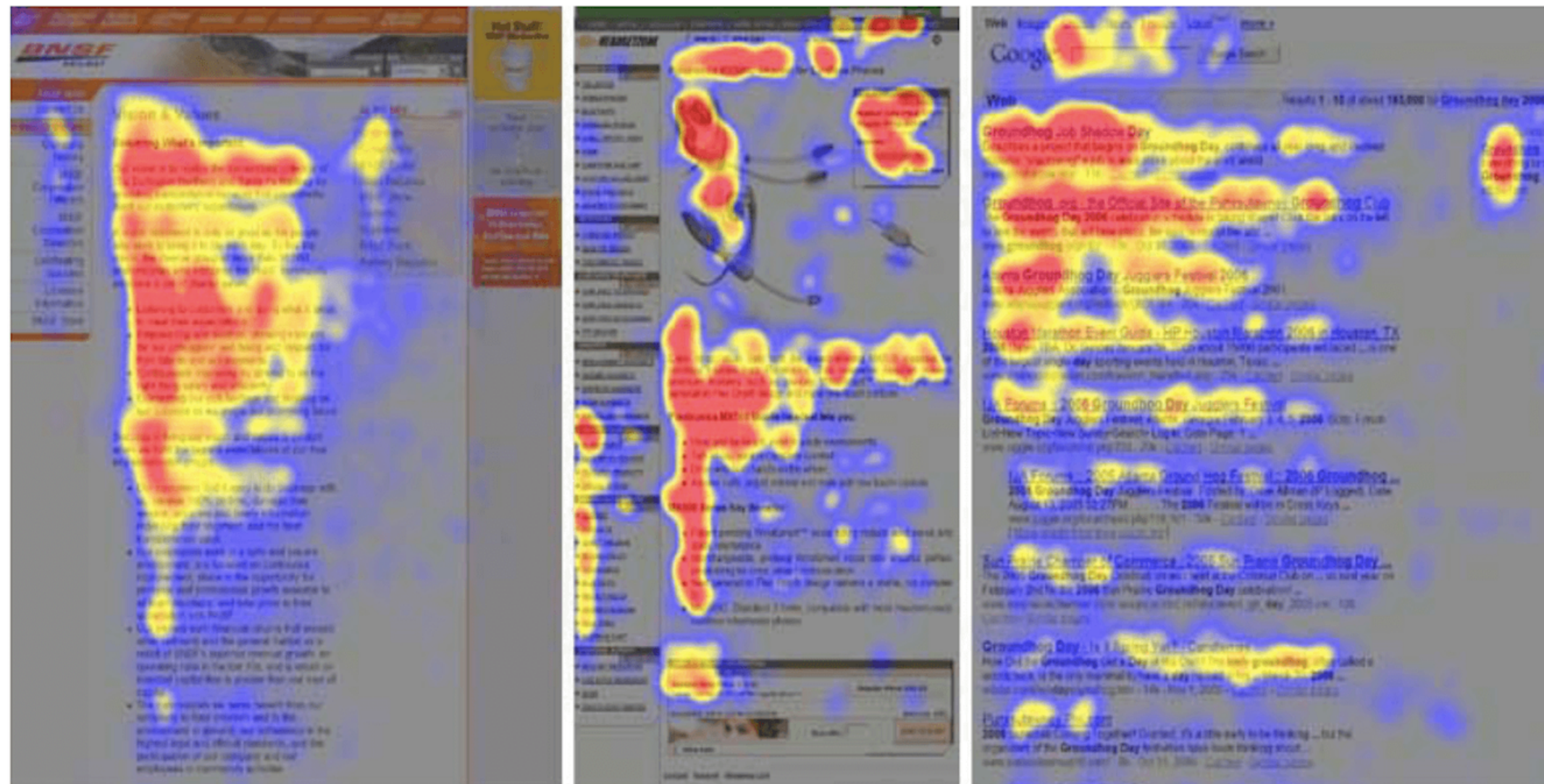
Eyetracking by Nielsen Norman Group nngroup.com NN/g